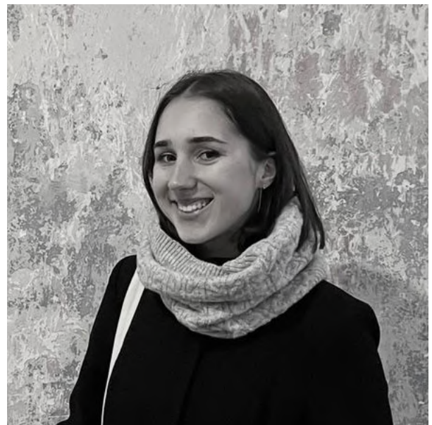
Larisa Hățiș Traditional Building Cultures Foundation