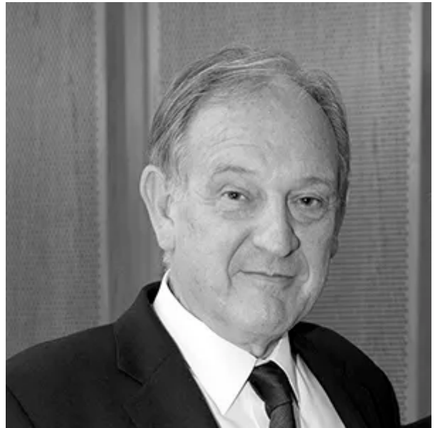
Leopoldo Gil Traditional Building Cultures Foundation | INTBAU Spain