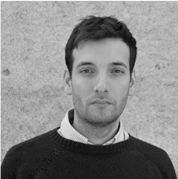
Guillermo Gil Fernández Traditional Building Cultures Foundation | INTBAU Spain