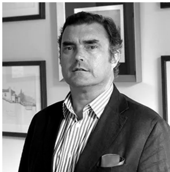
José Baganha Traditional Building Cultures Foundation | INTBAU Portugal